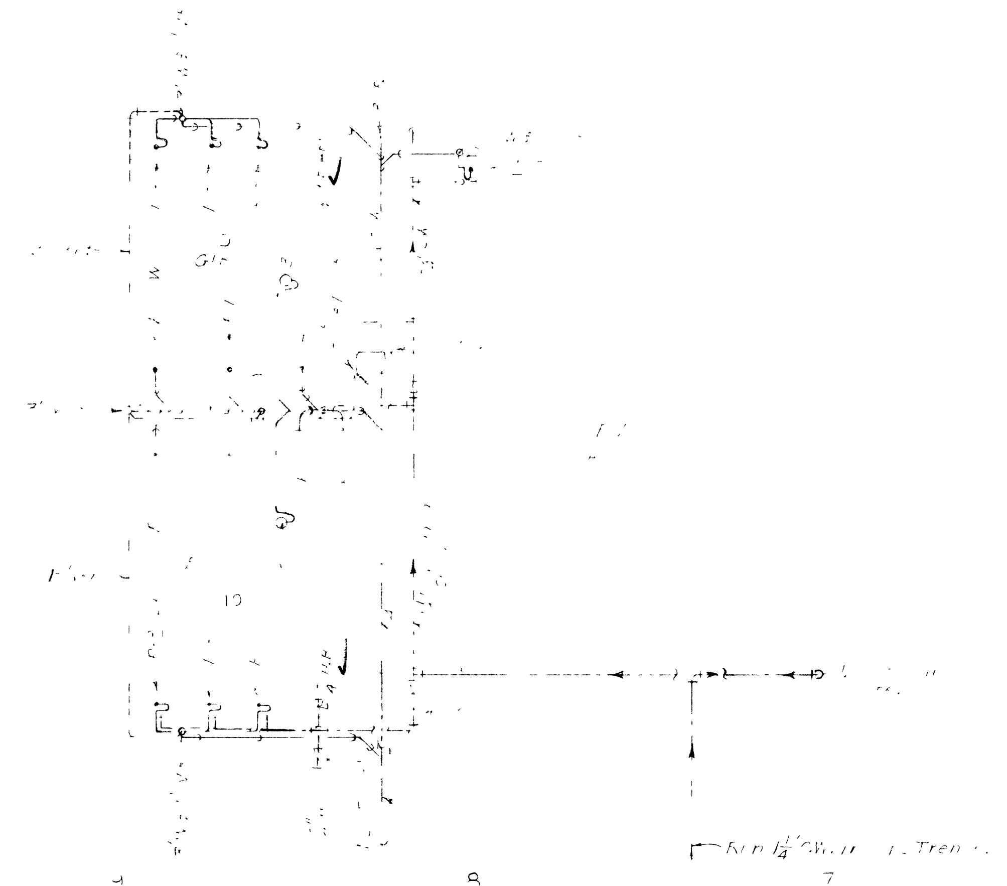
PLUMBING PLAN SCALE: 1/8" = 1'-0"