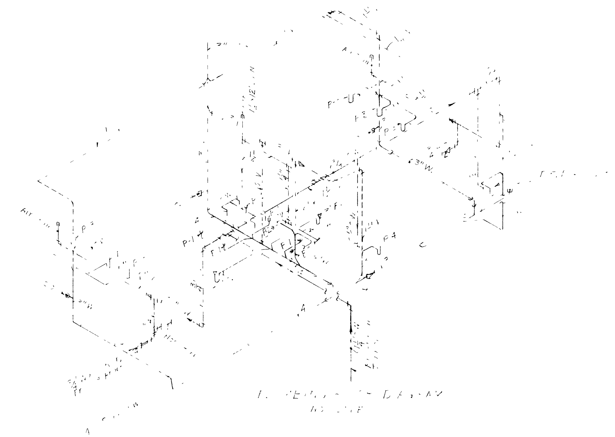
PLUMBING PLAN SCALE: 1/8" = 1'-0"